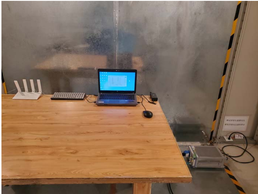
Conducted Emissions - Rear Side