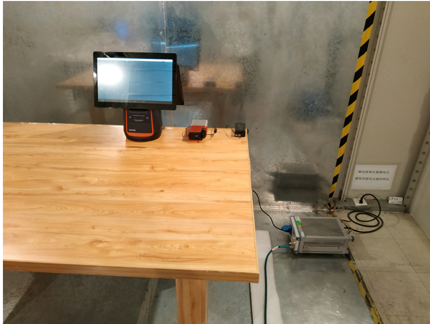
Conducted Emissions -Rear Side