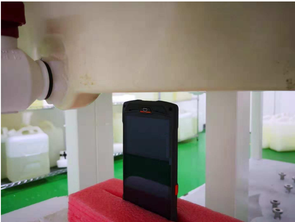
Toward Bottom (10mm)