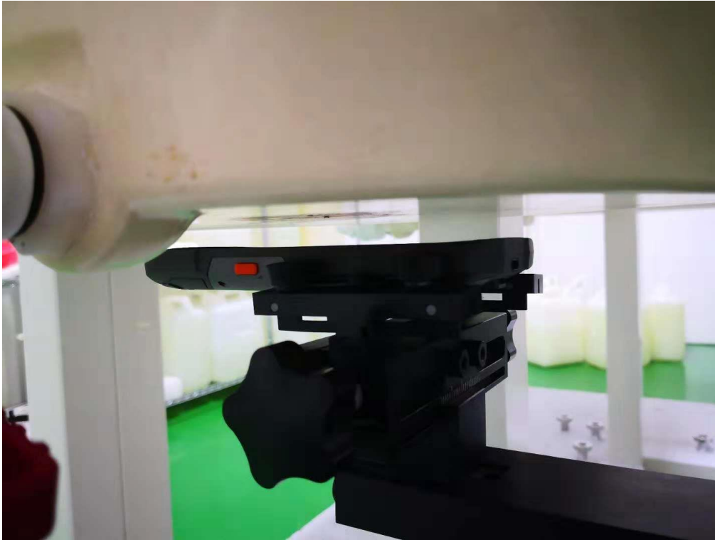
Toward Phantom (10mm)

According to the antenna position, the Body SAR is tested at the following 6 test positions all with the distance =10mm between the EUT and the phantom bottom :