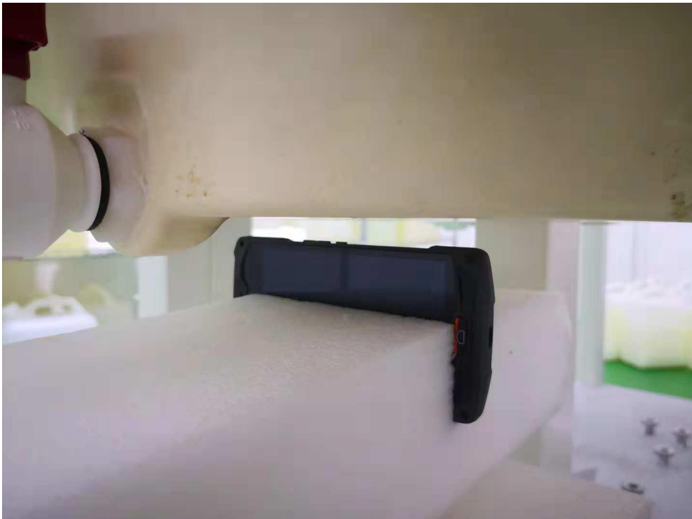
Toward Right (10mm)