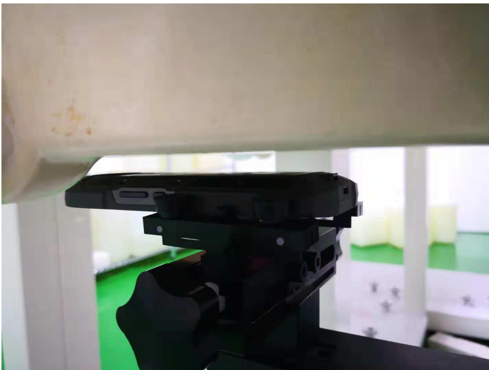
Toward Ground (10mm)