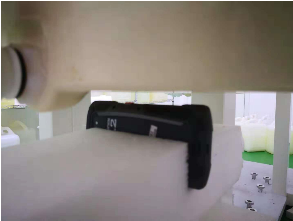
Toward Left (10mm)