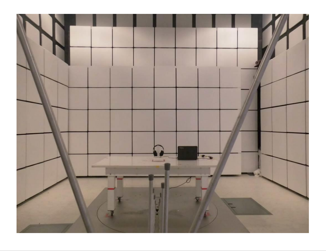
Report No.: BTL-FCCP-1-1808T008