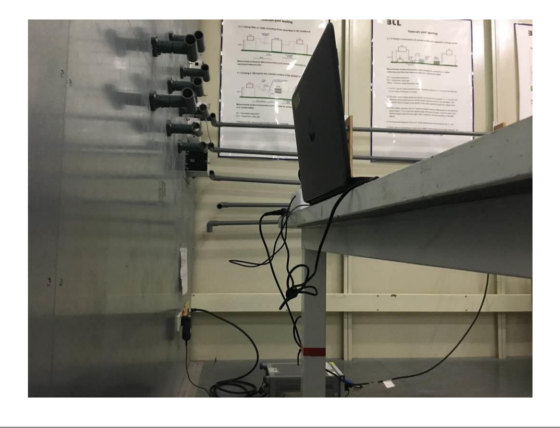
Report No.: BTL-FCCP-1-1808T008