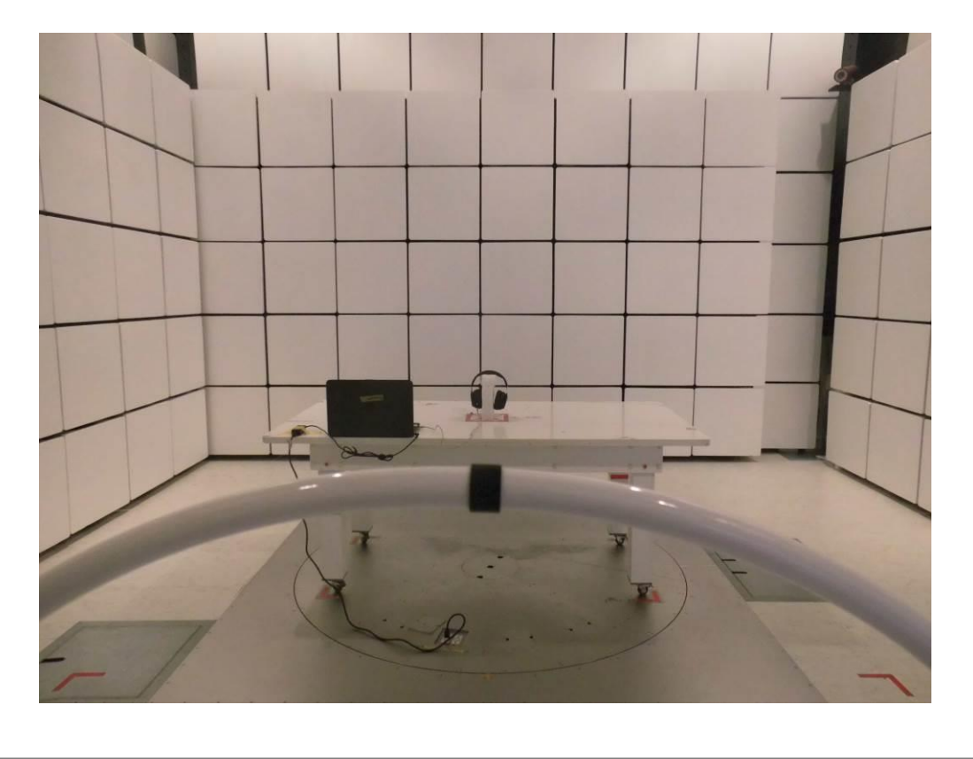
Report No.: BTL-FCCP-1-1808T008