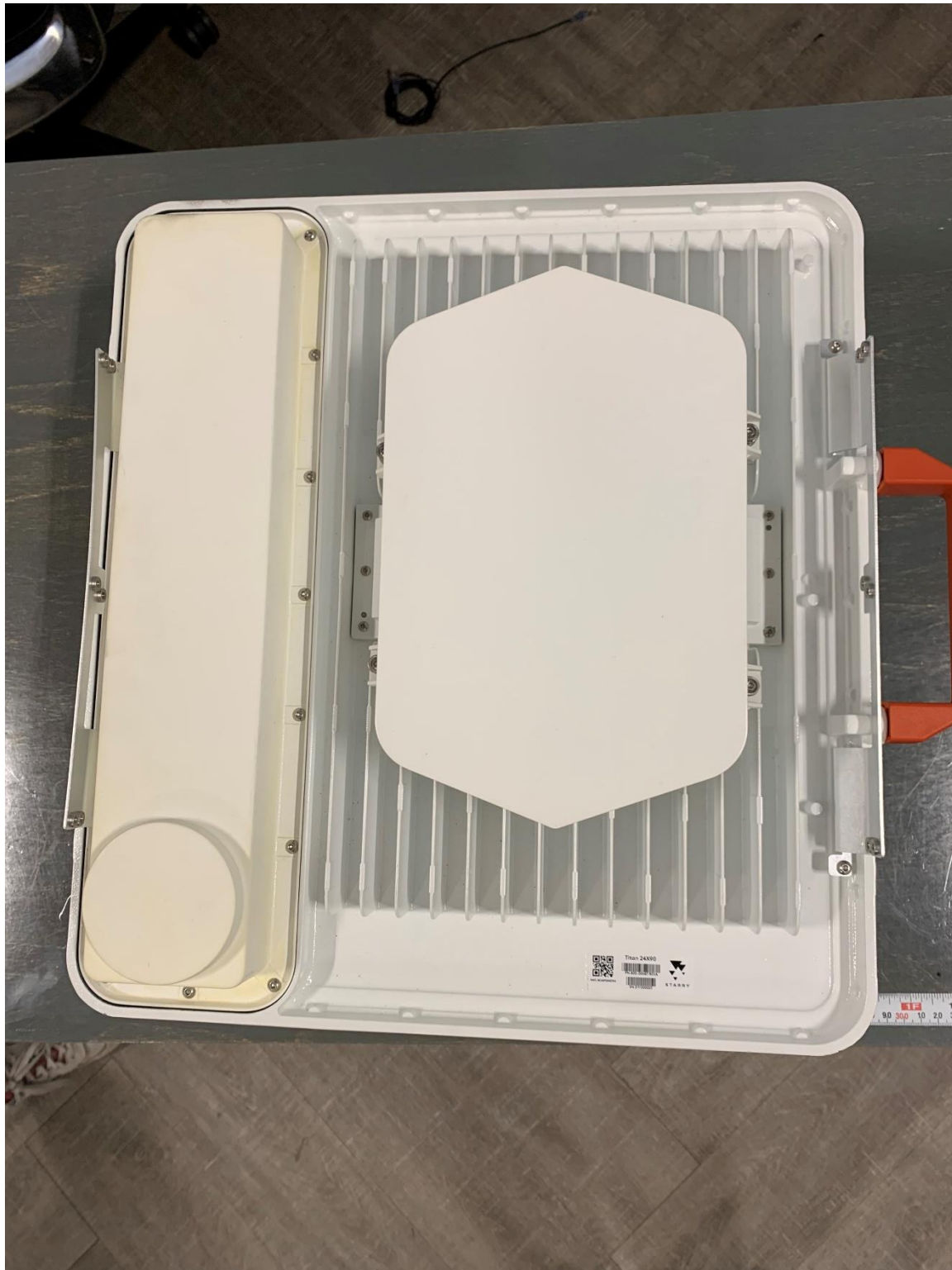
Figure 1. Front Assy View, External