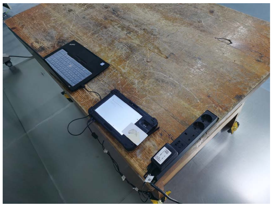
Page 1 of 3