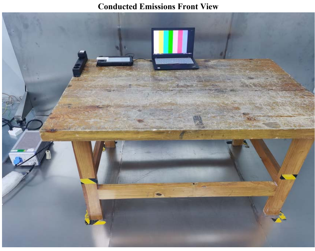
EXHIBIT D - TEST SETUP PHOTOGRAPHS