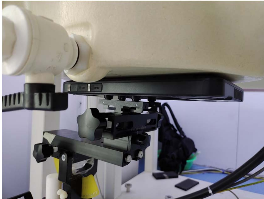
Body Left Setup Photo (0mm)