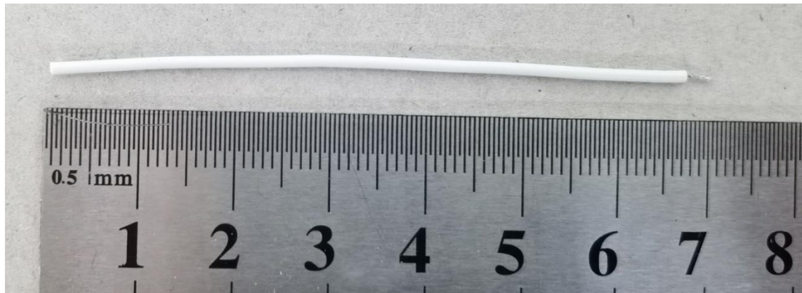
Antenna Photo & Length (mm)