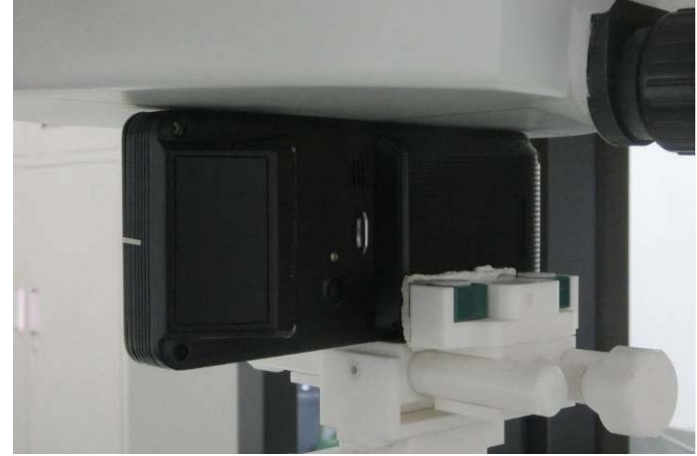
Left Side (Separation distance of 0mm)