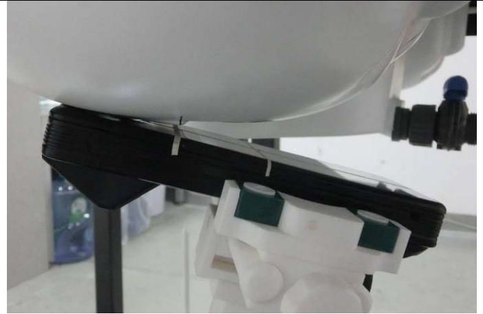
Right Tilt 15 Degree