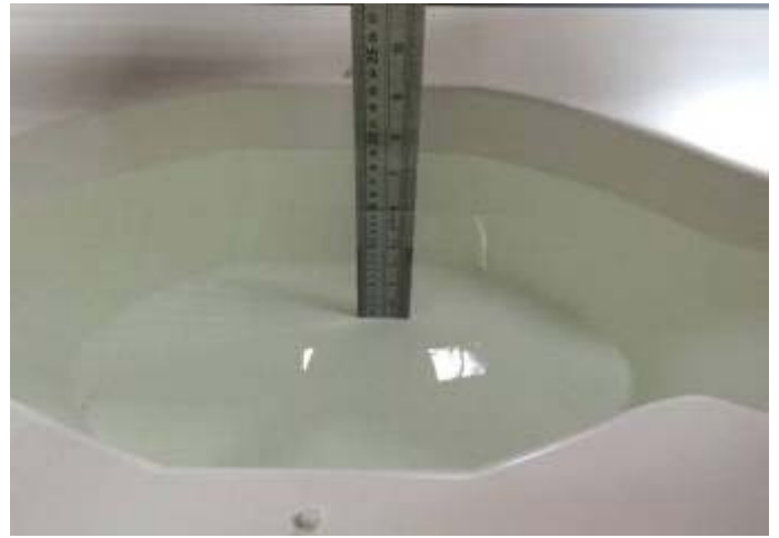
Body 850MHz depth (15.1cm)