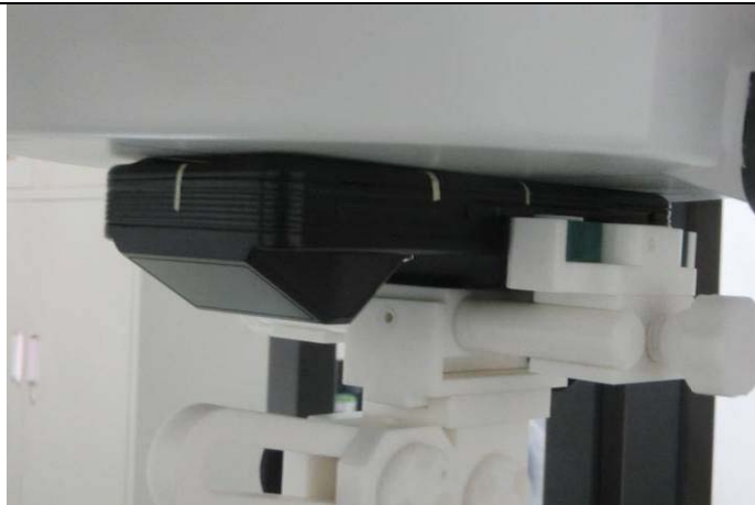
Front Side (Separation distance of 0mm)