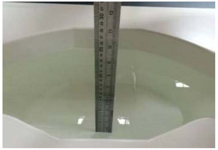
Body 1900MHz depth (15.2cm)