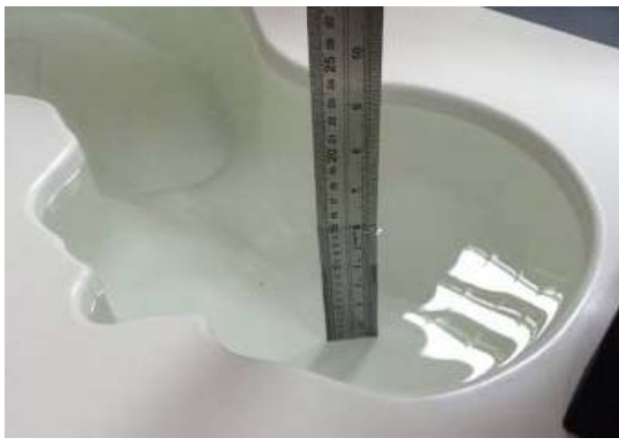
Head 2450MHz depth (15.2cm)