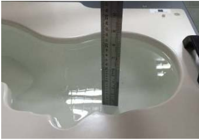
Head 1900MHz depth (15.3cm)