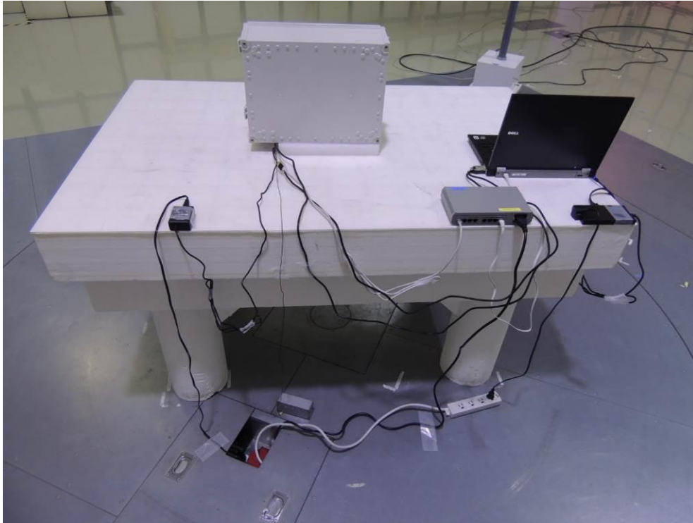
Photograph 6: Set-up for Radiated Emission of Transmitter above 1GHz, Front View