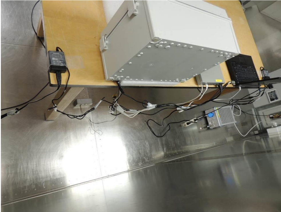
Photograph 4: Set-up for Radiated Emission of Transmitter below 1GHz band, Front View