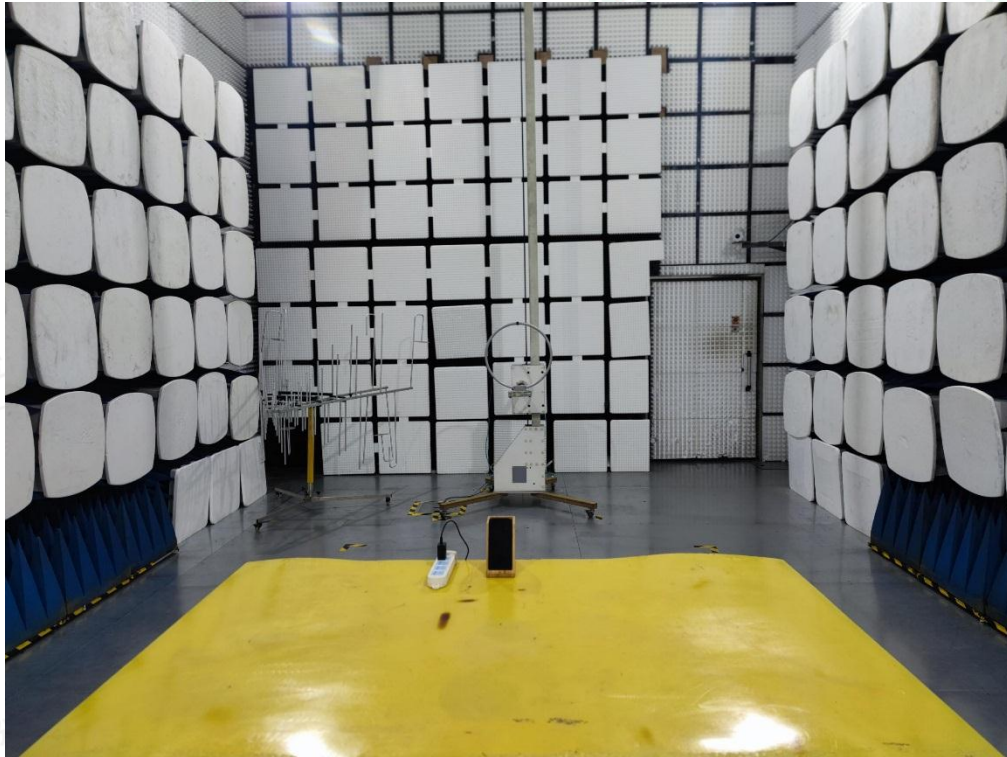
Radiated Emission below 30MHz-AC adapter charge mode