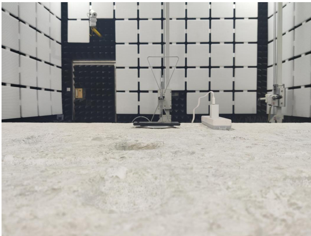
Radiated Emission below 1GHz