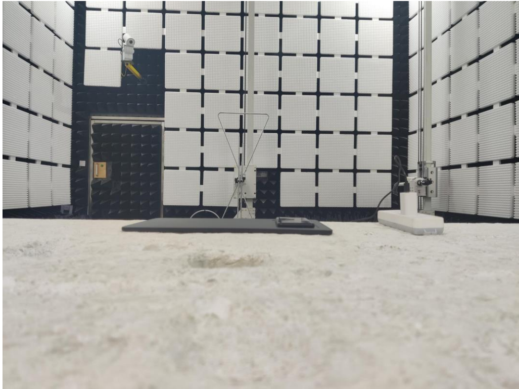
Radiated Emission below 1GHz