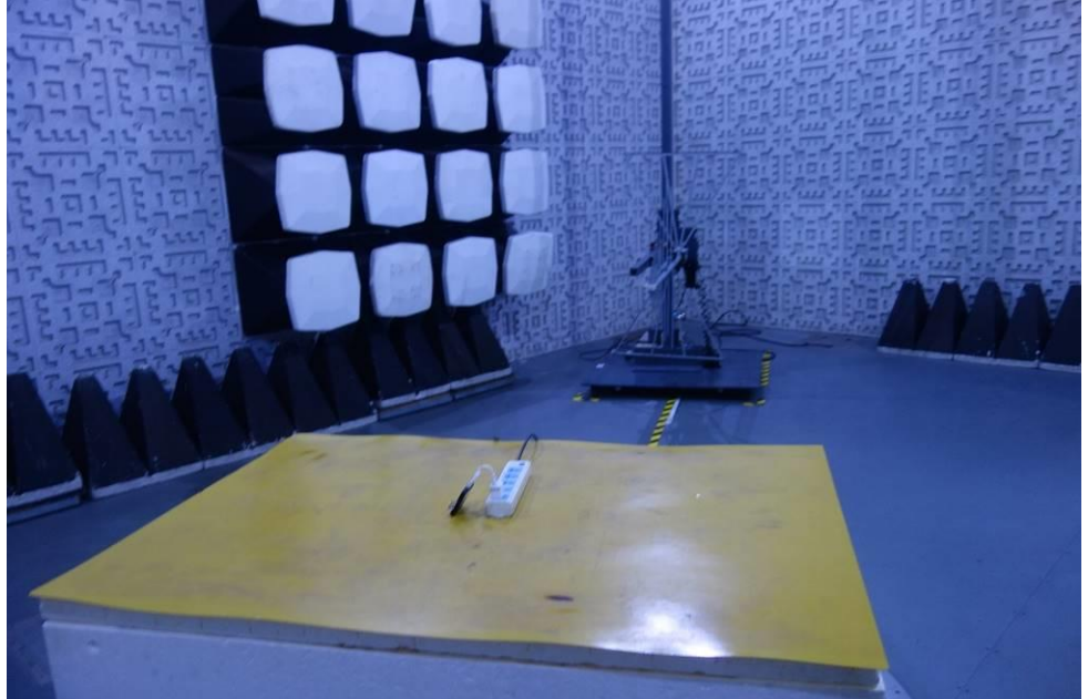
Radiated Spurious Emissions