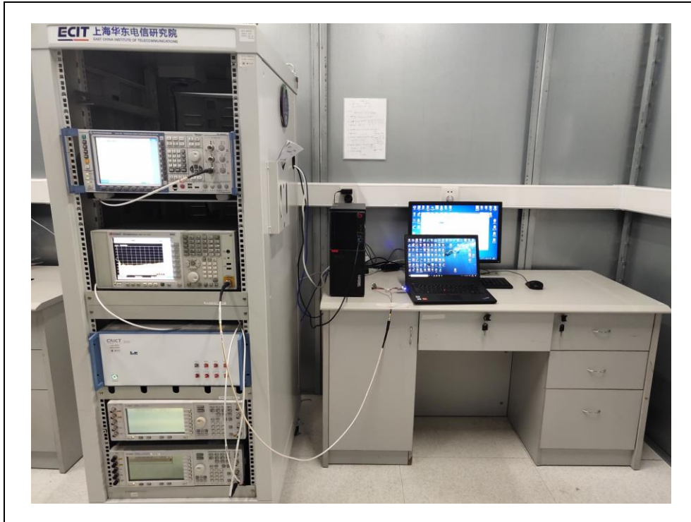
RF conducted test

NOTE: This document is issued by MORLAB, the test report shall not be reproduced except in full without prior written permission of the company. The test results apply only to the particular sample(s) tested and to the specific tests carried out which is available on request for validation and information confirmed at our website.