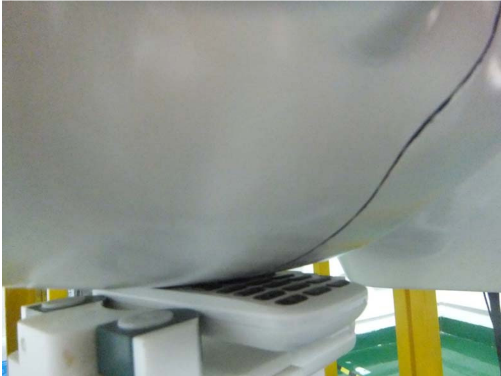
Right Head Tilt View