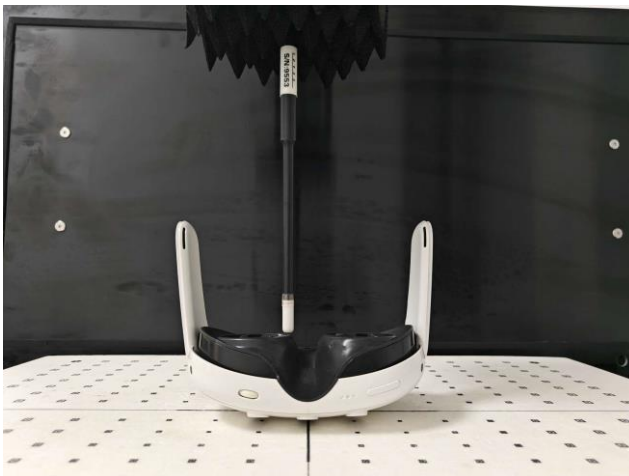
Inner Surface_ Left Ant 2, Test Separation 2 mm