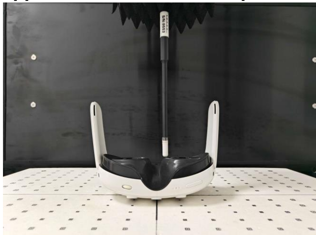
Inner Surface_ Right Ant , Test Separation 2 mm