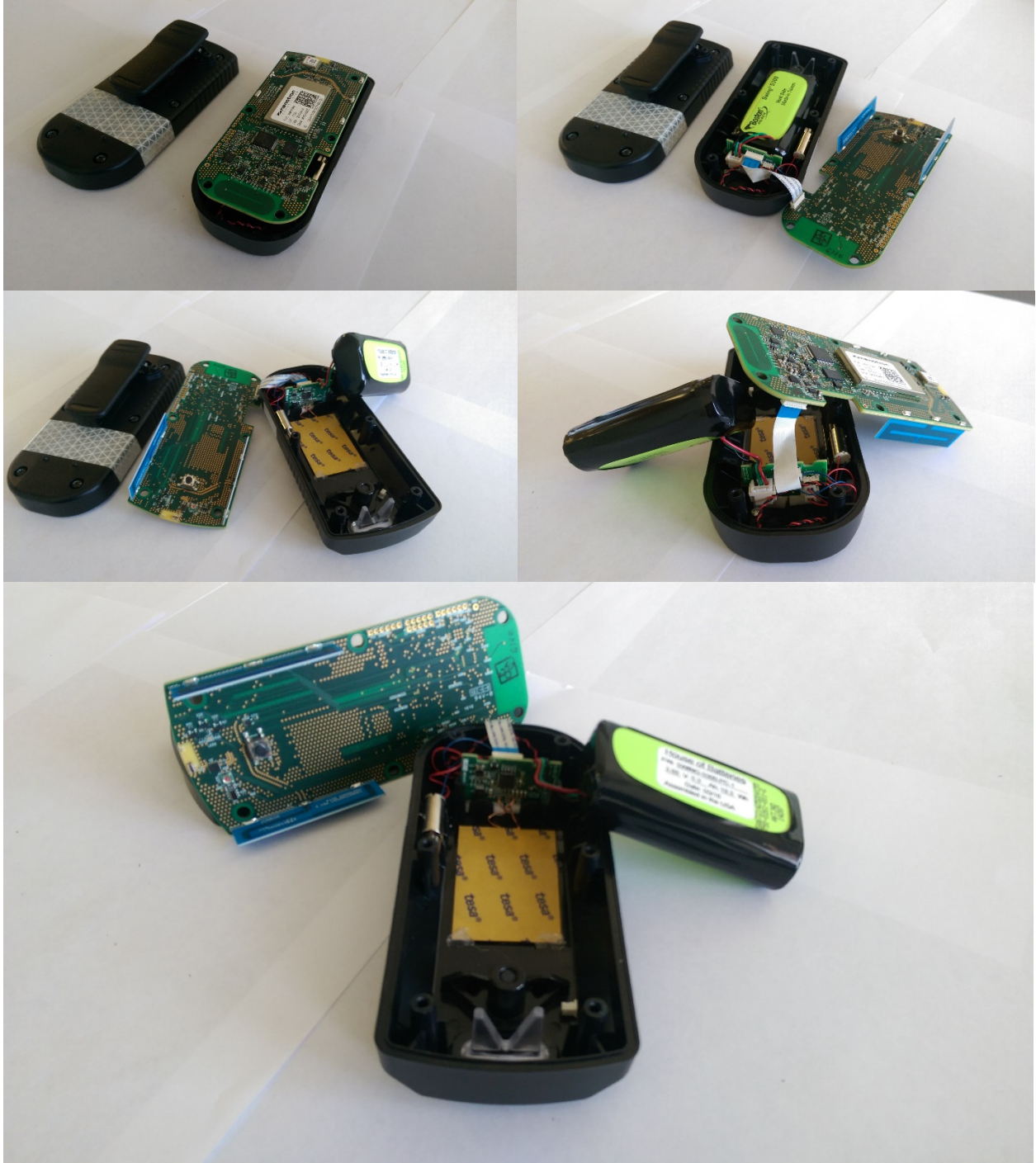
Personnel module housing