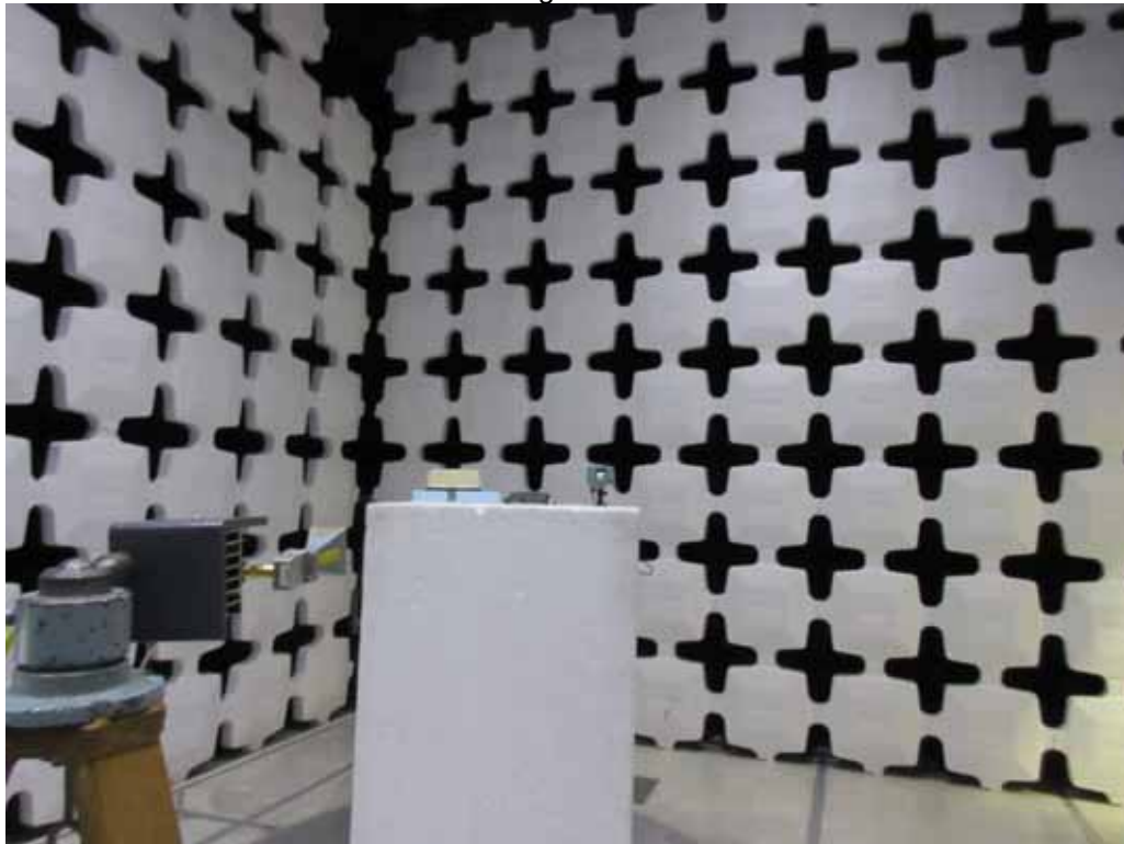
Test Setup for Radiated Emissions – 18GHz to 25GHz, Horizontal Polarization