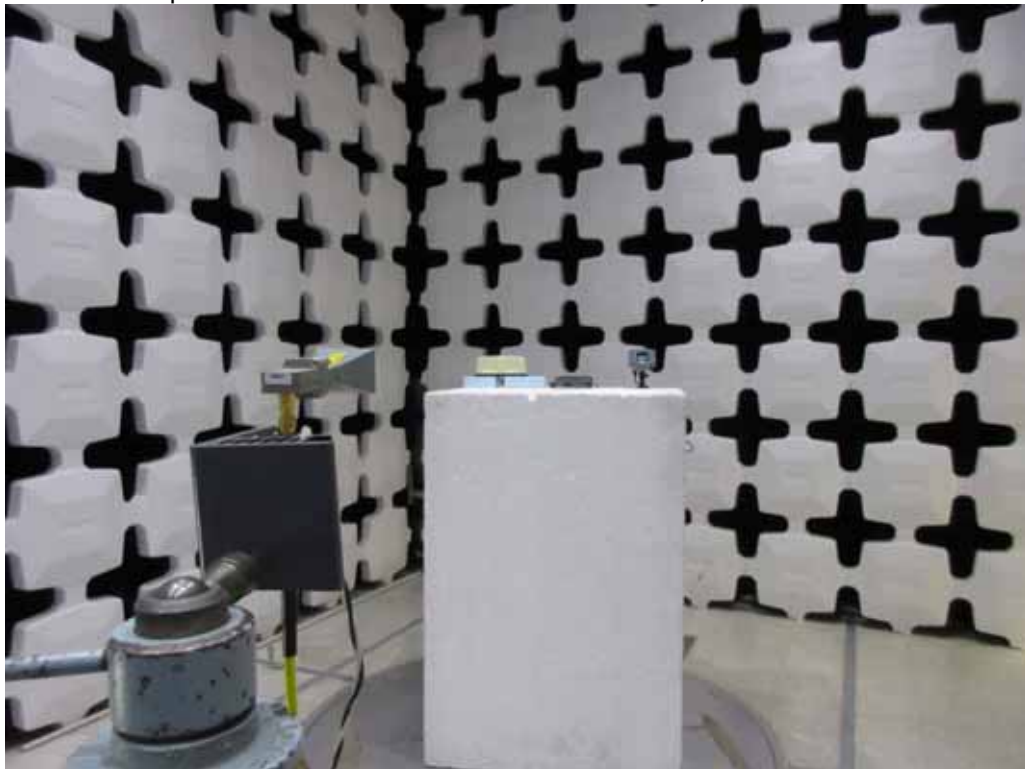
Test Setup for Radiated Emissions – 18GHz to 25GHz, Vertical Polarization