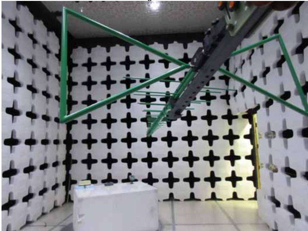
Test Setup for Radiated Emissions – 30MHz to 1GHz, Horizontal Polarization