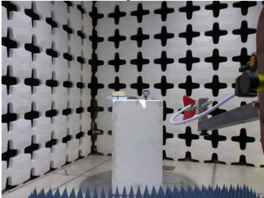
Test Setup for Radiated Emissions – 1GHz to 18GHz, Horizontal Polarization