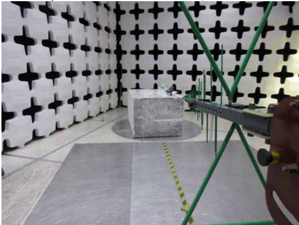
Test Setup for Radiated Emissions – 30MHz to 1GHz, Vertical Polarization