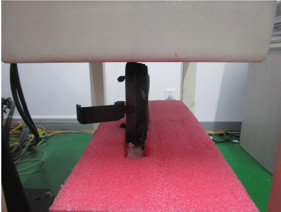
Test Position_Right (0mm)