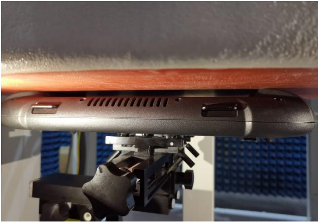
Back side (1g SAR for ANT 1, ANT 2 and ANT 3) (0mm)