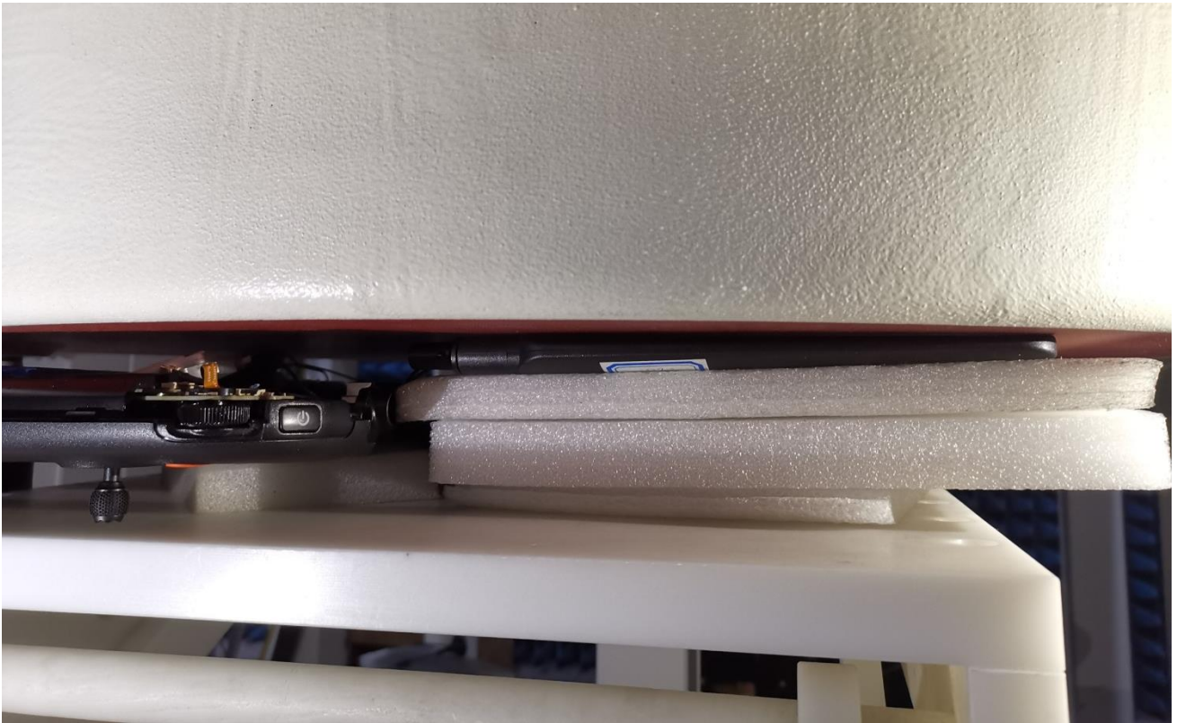
Horizontal mode (Test distance: 0mm) (10g SAR for ANT 5 and ANT 6)