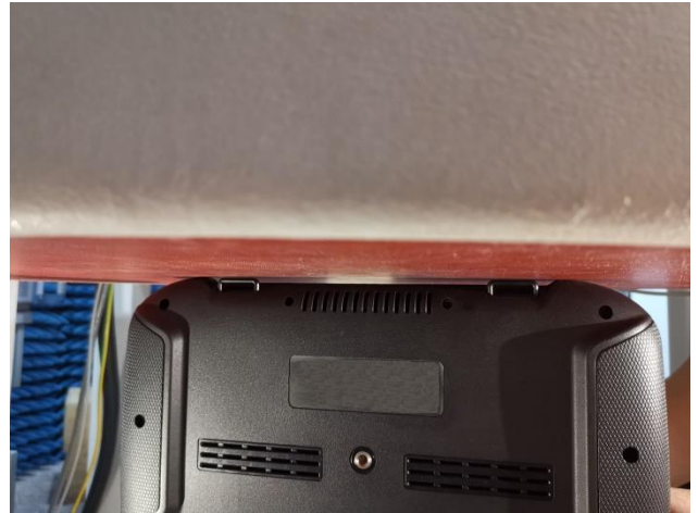
Bottom side (1g SAR for ANT 1 and ANT 2) (0mm)