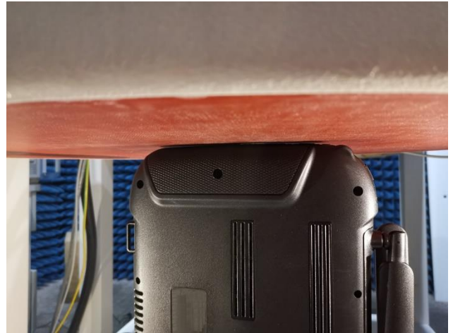
Right side (1g SAR for ANT 1 and ANT 3) (0mm)