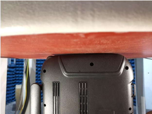
Left side (1g SAR for ANT 2) (0mm)