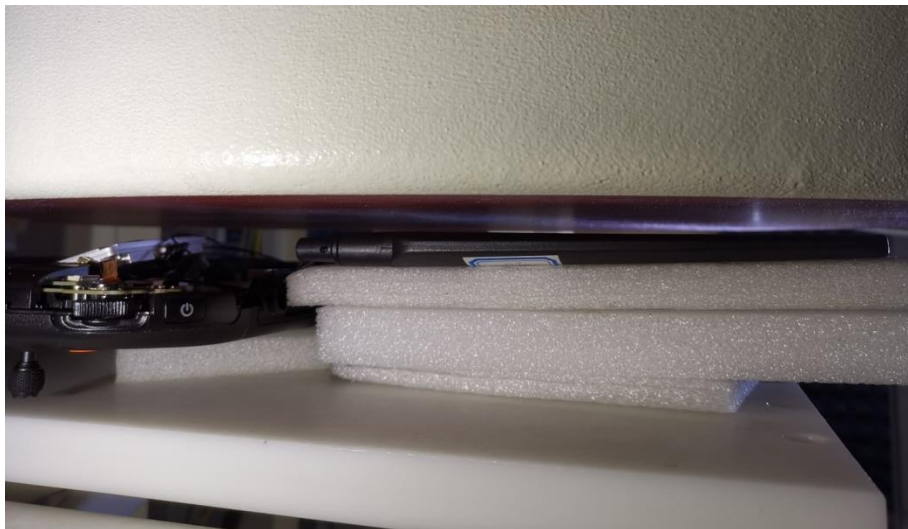
Horizontal mode (Test distance: 10mm) (1g SAR for ANT 5 and ANT 6)