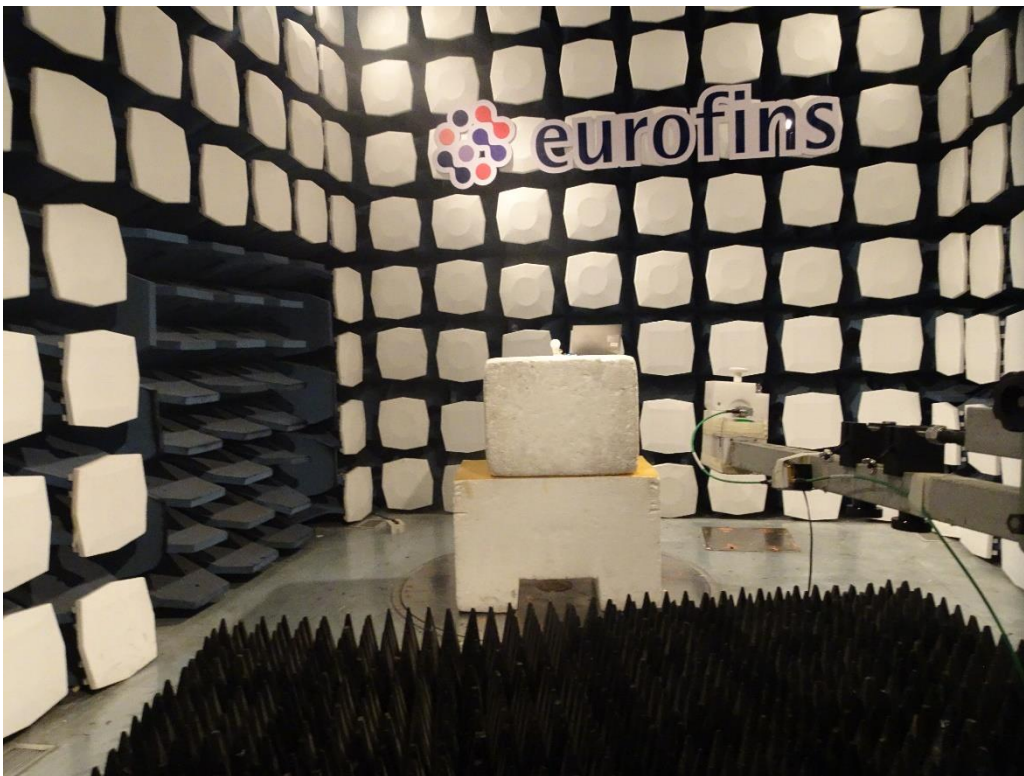
18GHz - 26.5GHz