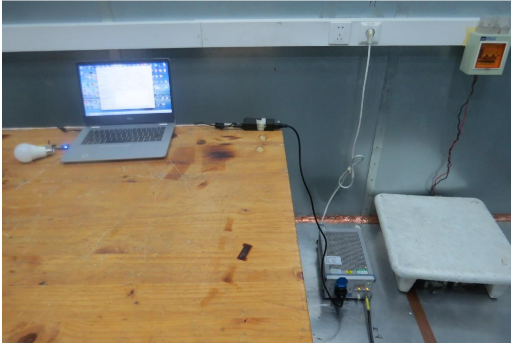
Picture 2 Conducted Emission Test Setup