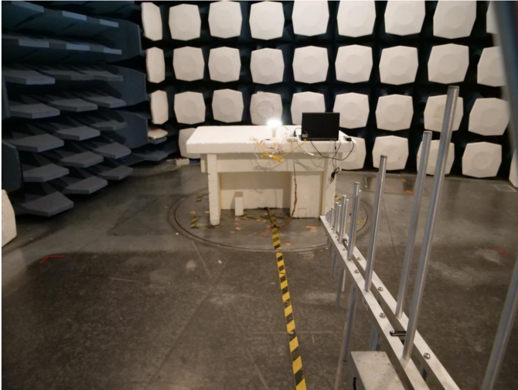
a: Below 1GHz