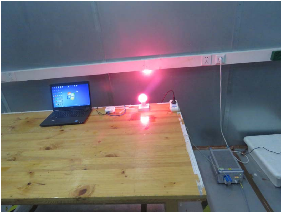
Picture 3 Conducted Emission Test Setup