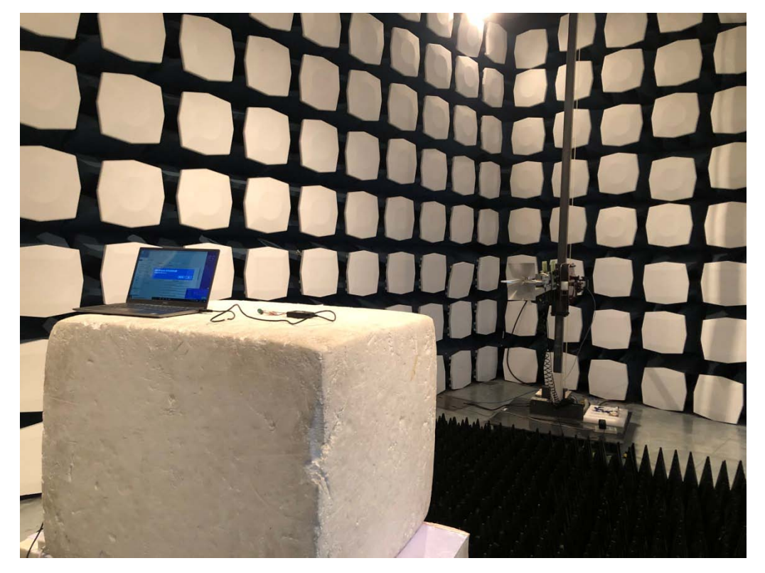
1GHz-18GHz Picture 1 Radiated Emission Test Setup