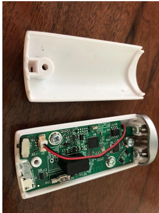
Photograph 3 – View of the Component Side Of PCB Showing Top Plastic Removed