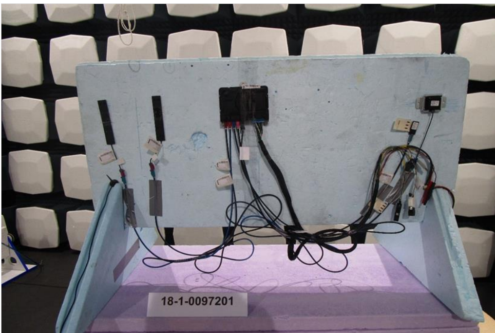
Photograph 2: EUT Test Setup in the anechoic chamber, Radiated interference field strength