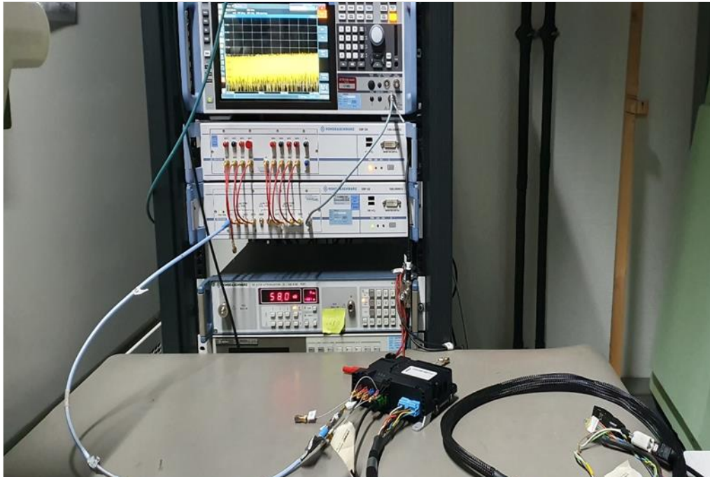
Photograph 5: EUT Setup Conducted measurements