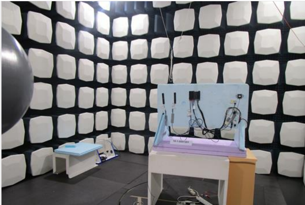
Photograph 1: EUT Test Setup in the anechoic chamber, Radiated interference field strength