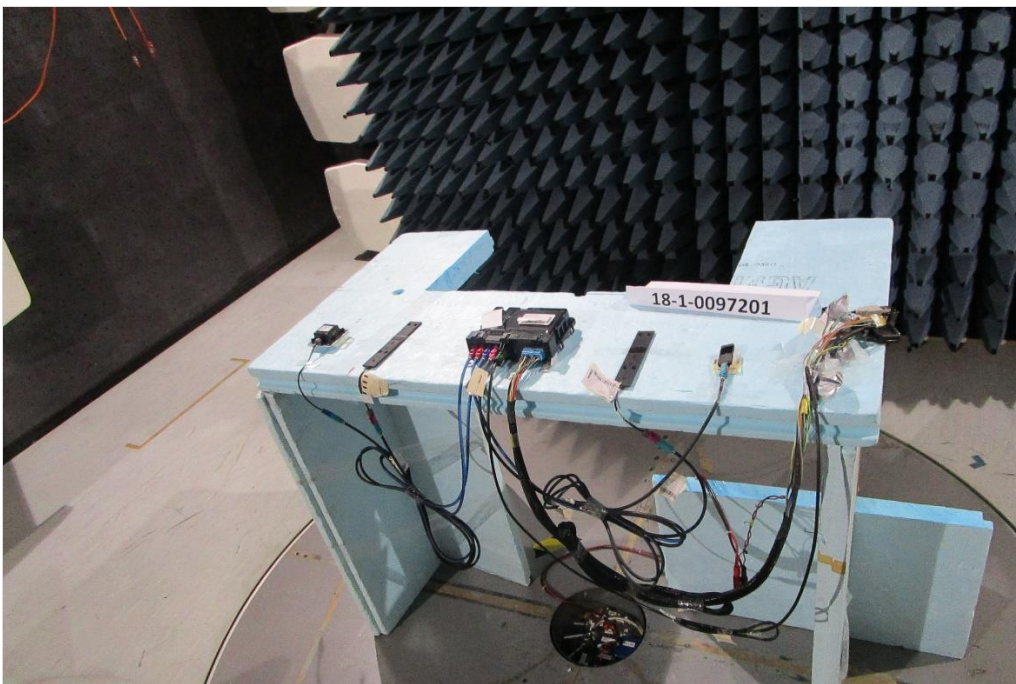
Photograph 4: EUT Setup Magnetic Field Measurements in the Semi anechoic chamber