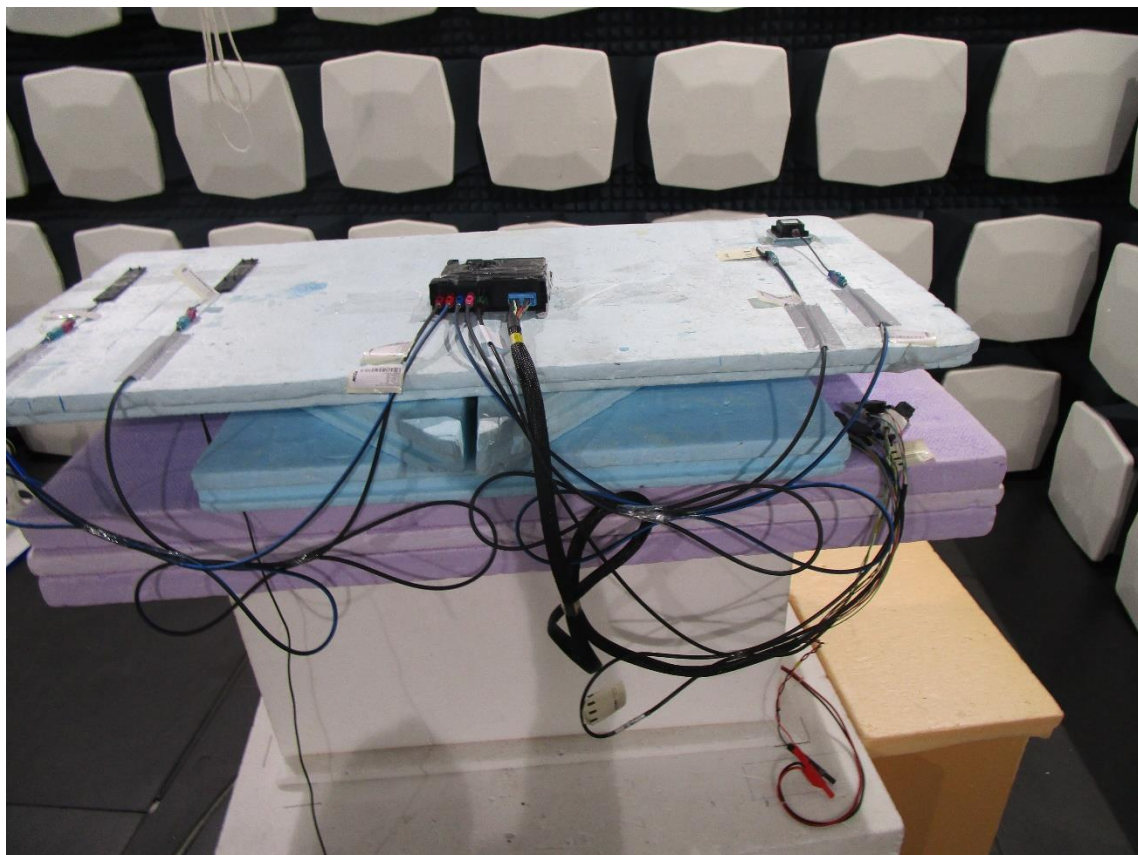
Photograph 4: EUT laying: close view