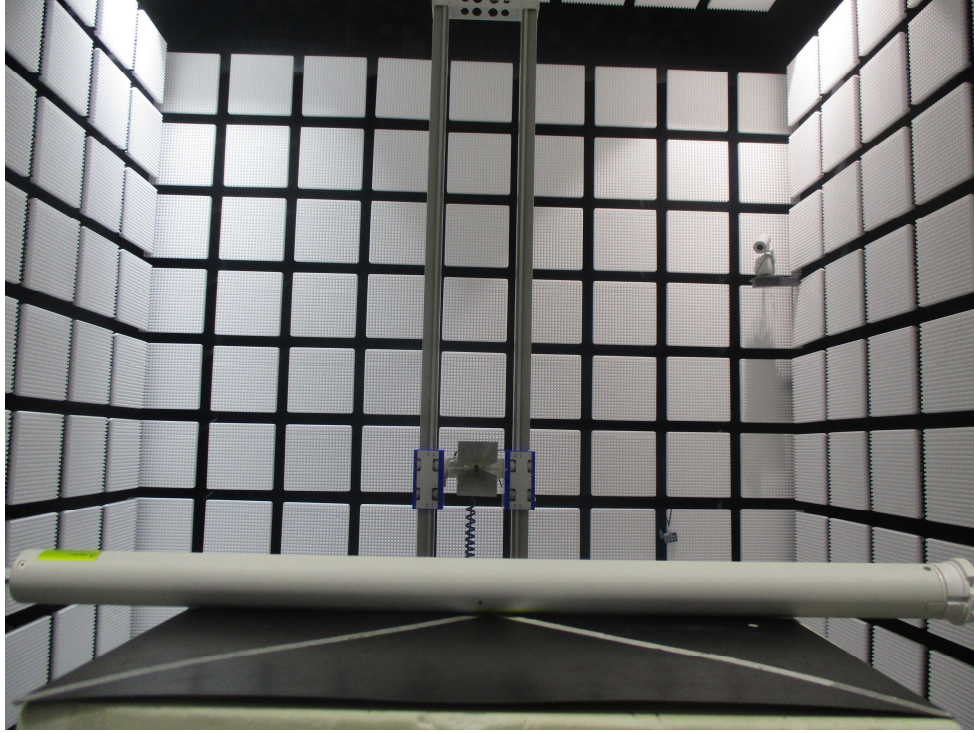
Radiated Emission Test above 1GHz