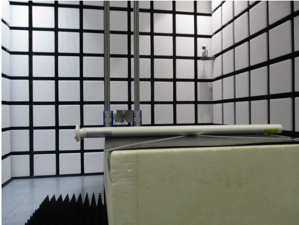
Radiated Emission Test above 1GHz