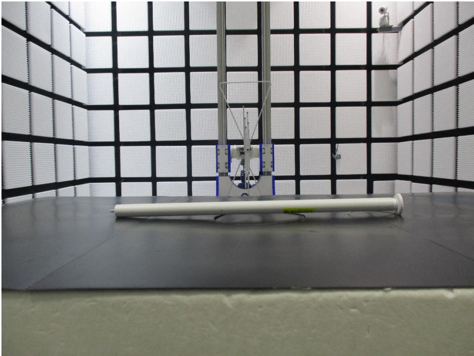
Radiated Emission Test below 1GHz