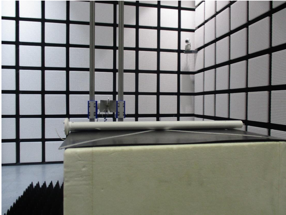
Radiated Emission Test above 1GHz