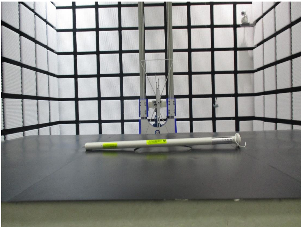
Radiated Emission Test below 1GHz