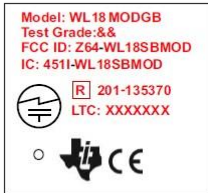
Figure 6-2. WiLink 8 Module Markings

Figure 6-2 shows the markings for the TI WiLink 8 module.