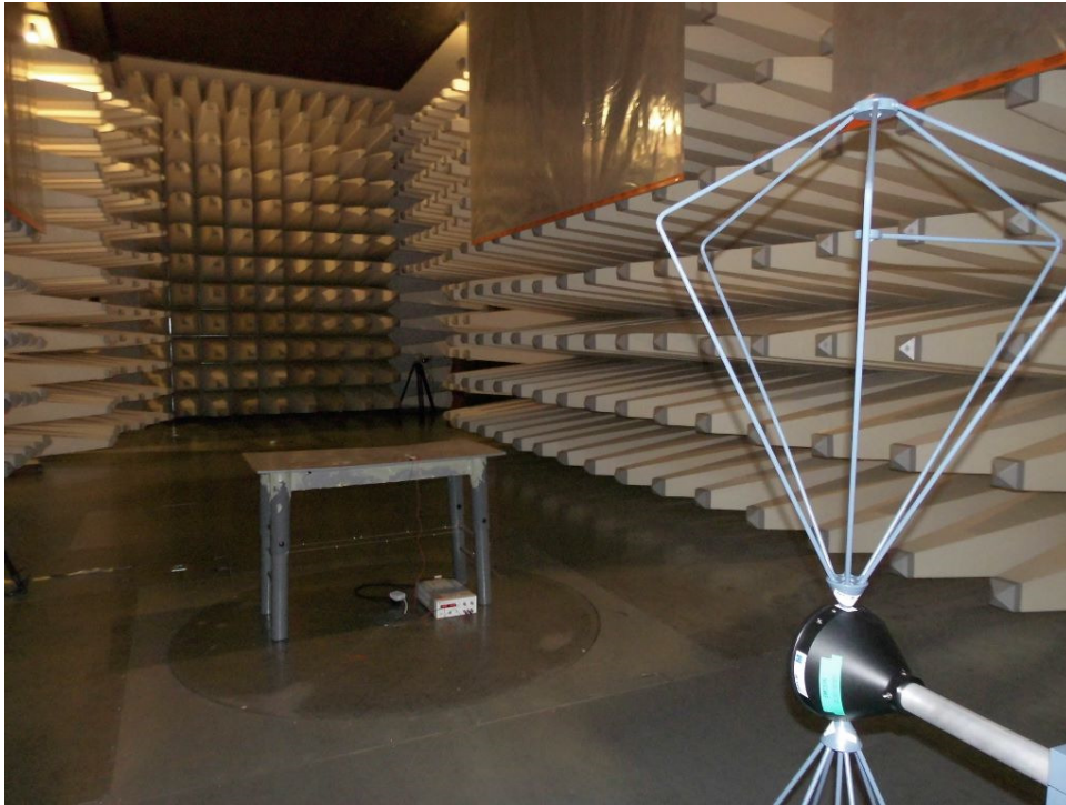
Set-up for Radiated Emission