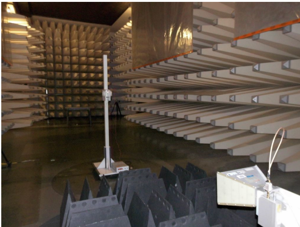
Set-up for Radiated Emission