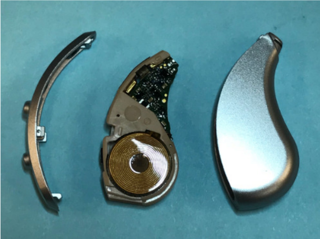
Processor with removed cover and PCBA Side 1