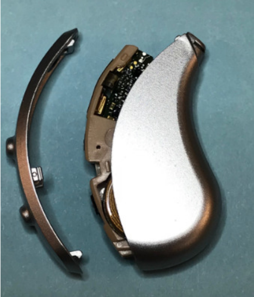
Processor with removed cover and PCBA Side 1