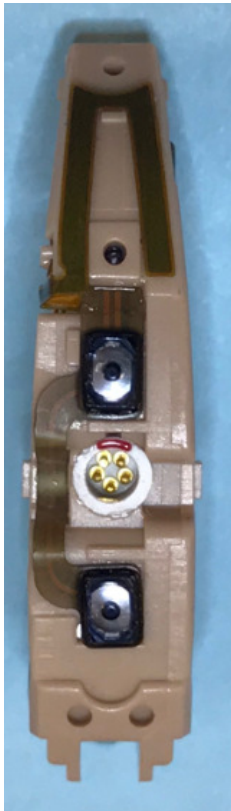
Processor PCBA Front 1