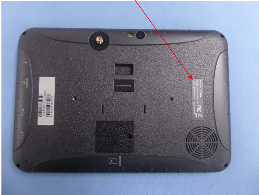
FCC ID Label Location