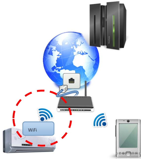
picture 1: The function of WiFi module in the intelligent home appliance system