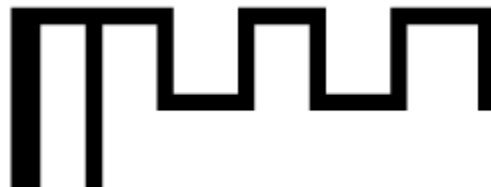
PCB PIFA antenna