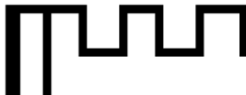
PCB PIFA antenna