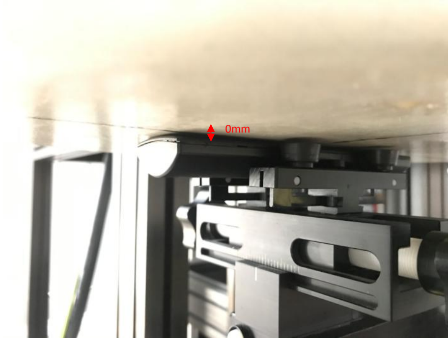
Handheld Back Setup Photo (0mm)