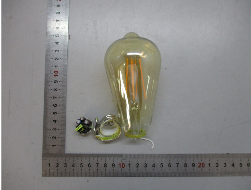
EUT – PCB-1 Top View