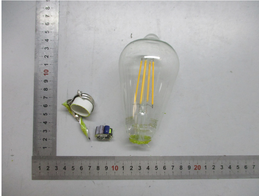
EUT – PCB-1 Top View