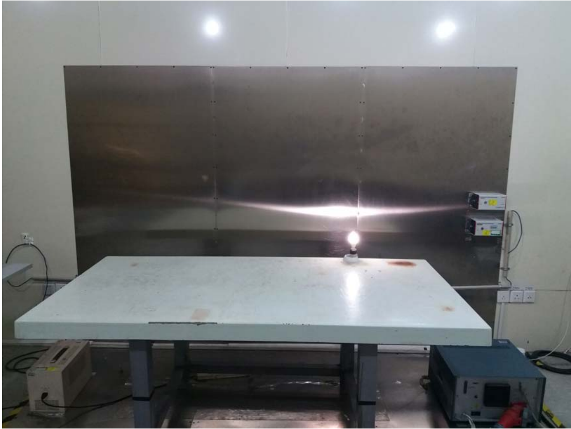
Front View of Conducted Disturbance Measurement