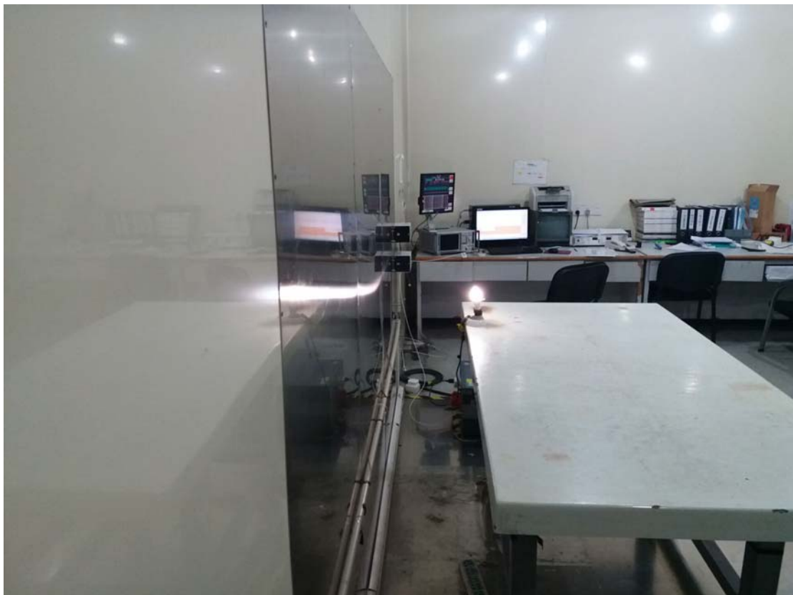
Side View of Conducted Disturbance Measurement