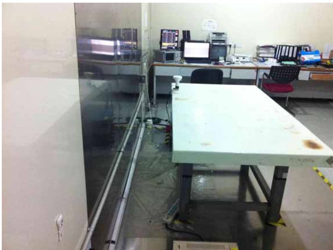
Side View of Conducted Disturbance Measurement