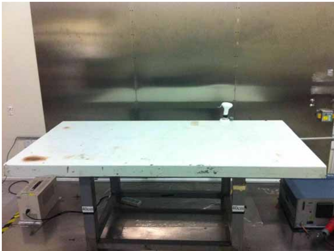
Front View of Conducted Disturbance Measurement