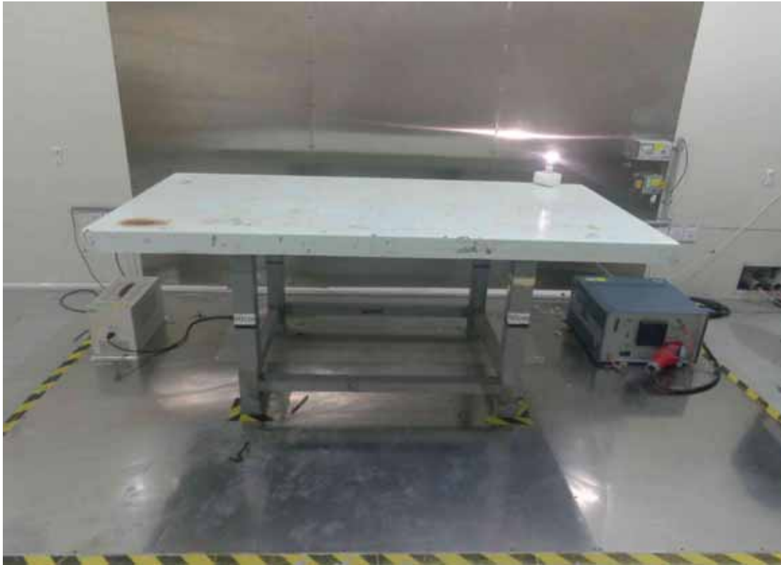
Front View of Conducted Disturbance Measurement