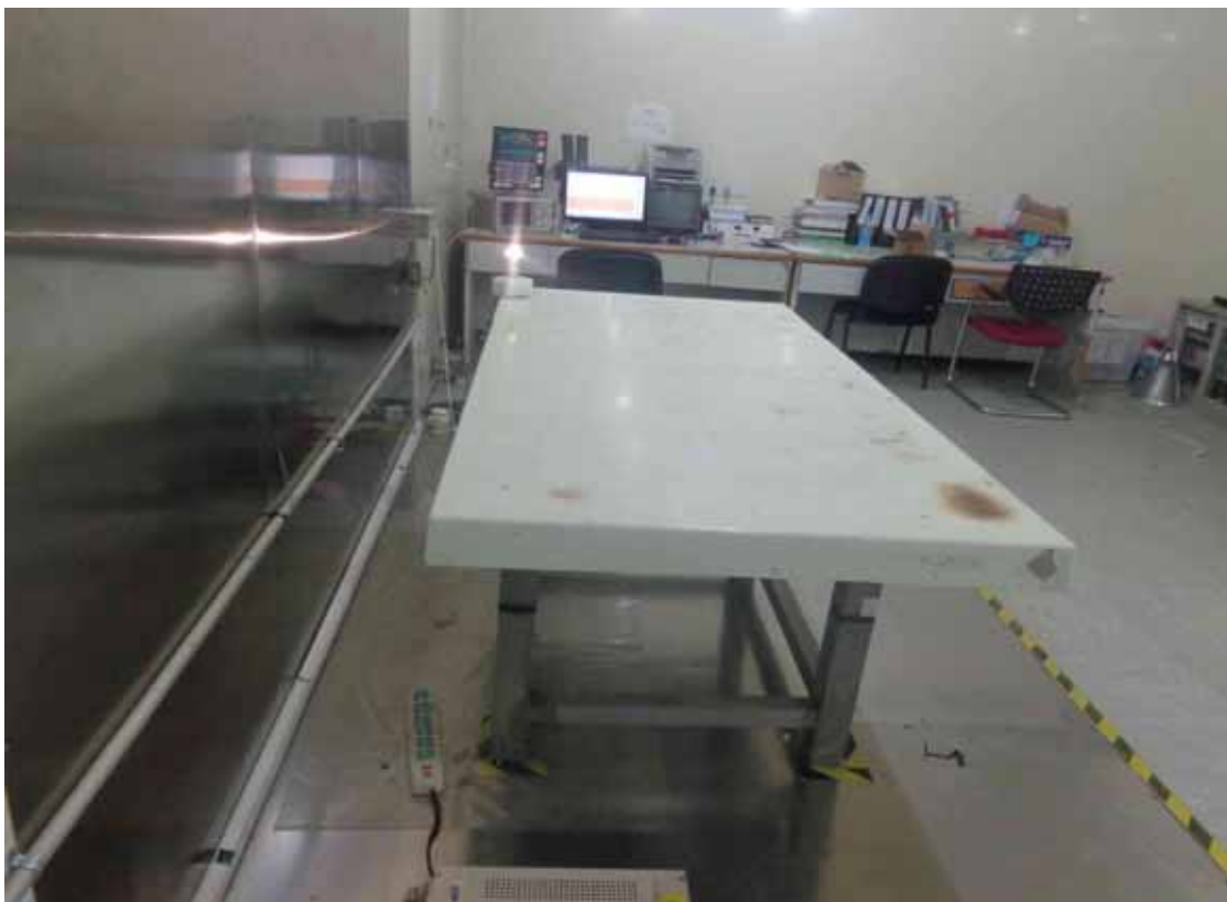
Side View of Conducted Disturbance Measurement