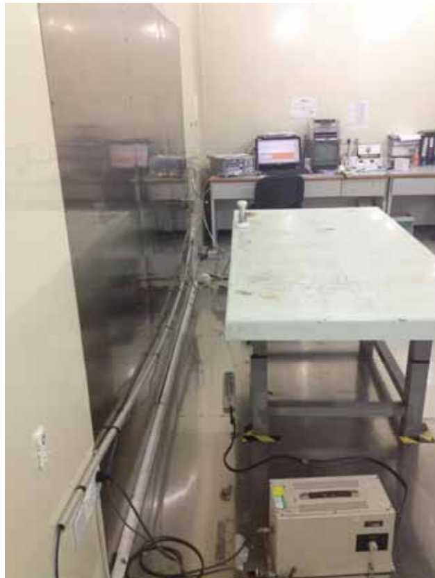
Side View of Conducted Disturbance Measurement