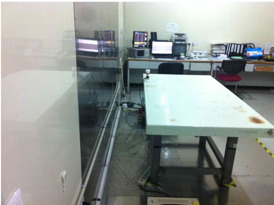
Side View of Conducted Disturbance Measurement