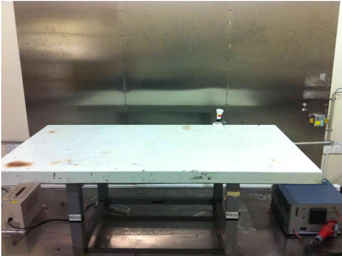
Front View of Conducted Disturbance Measurement