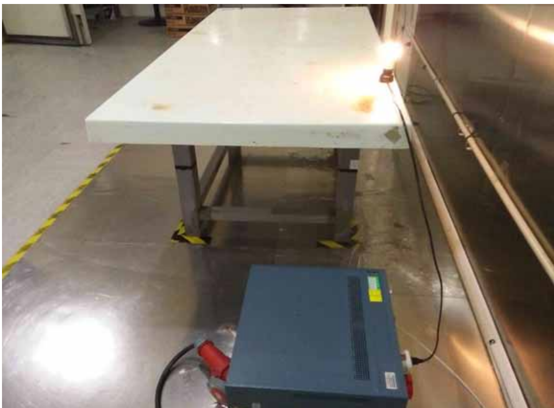
Side View of Conducted Disturbance Measurement