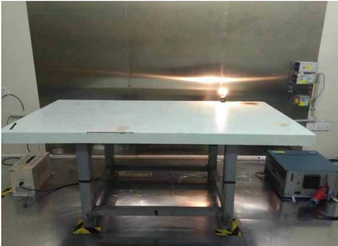
Front View of Conducted Disturbance Measurement