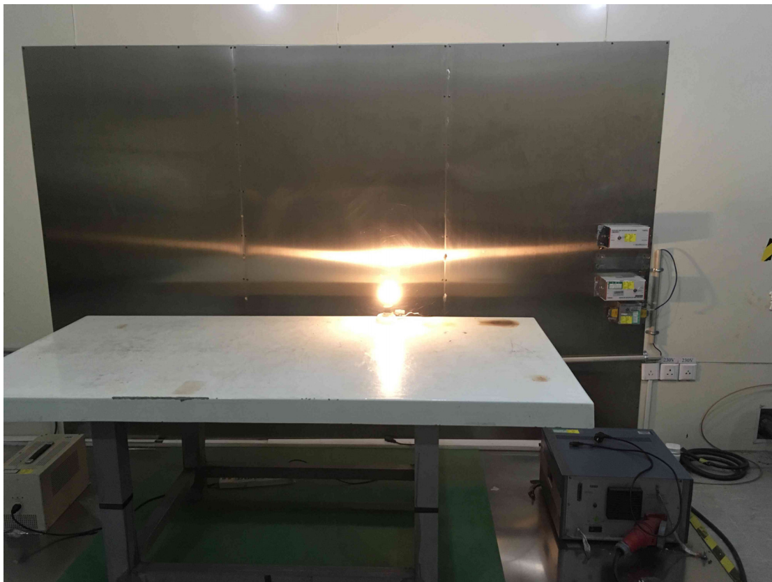
Front View of Conducted Disturbance Measurement