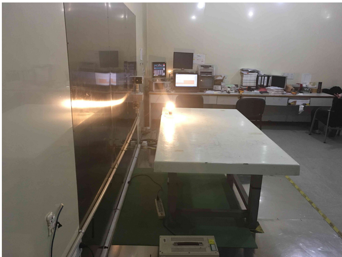
Side View of Conducted Disturbance Measurement