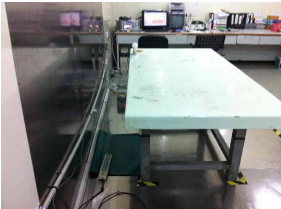
Side View of Conducted Disturbance Measurement