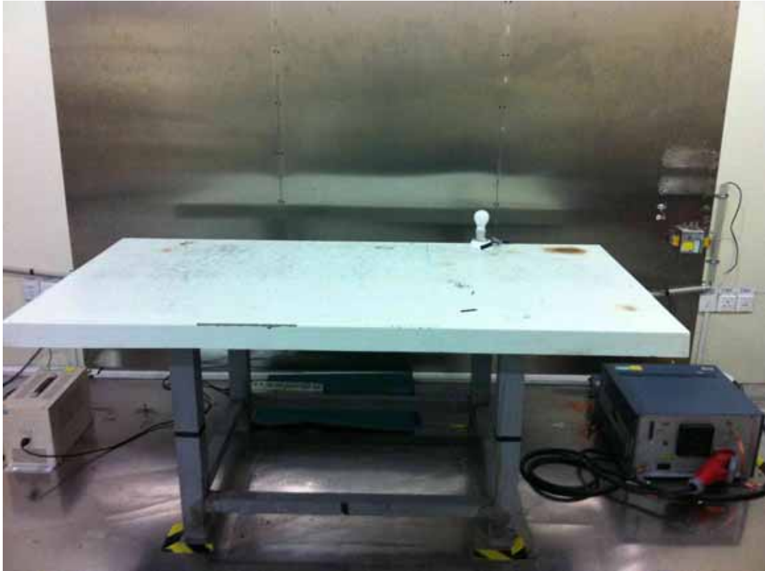
Front View of Conducted Disturbance Measurement