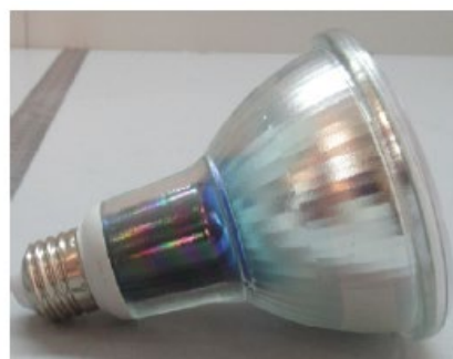
long lamp neck

(9290022546, 9290022547, 9290022548, 9290022549, 9290022550, 9290022551)