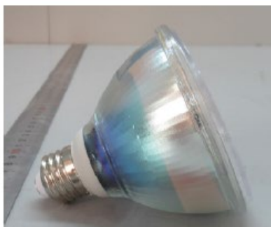
short lamp neck

(9290022546, 9290022547, 9290022548, 9290022549, 9290022550, 9290022551)